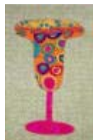
Margarita's on the Patio

For those that get a printed newsletter two patterns are included and copies of some of the patterns will be available at the meeting.