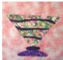
Mango Tango on the Cruise