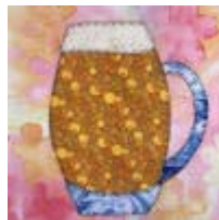
This Beer's On Me!